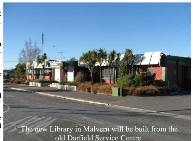
The new Library in Malvern will be built from the old Darfield Service Centre.

"This means adding some more room to the council building. Councillors have allowed for this in the budget, their over-riding philosophy being to do it once and do it right."